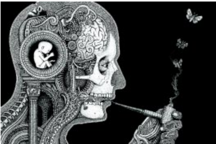
Ink on board

In life I question everything and never assume I'm right. With art I try to make exactly what I want to make regardless of how it's received by other people. I'm determined to never allow my work to be influenced by economic factors. I don't think it's hard to be a successful artist given enough time, but it is hard to be a good artist, to have something unique and meaningful to add to culture. I'm interested in learning as much as I can about the world and human culture's ongoing efforts to understand it. And I tend to be more interested in things that are on the fringes of our ability to understand.