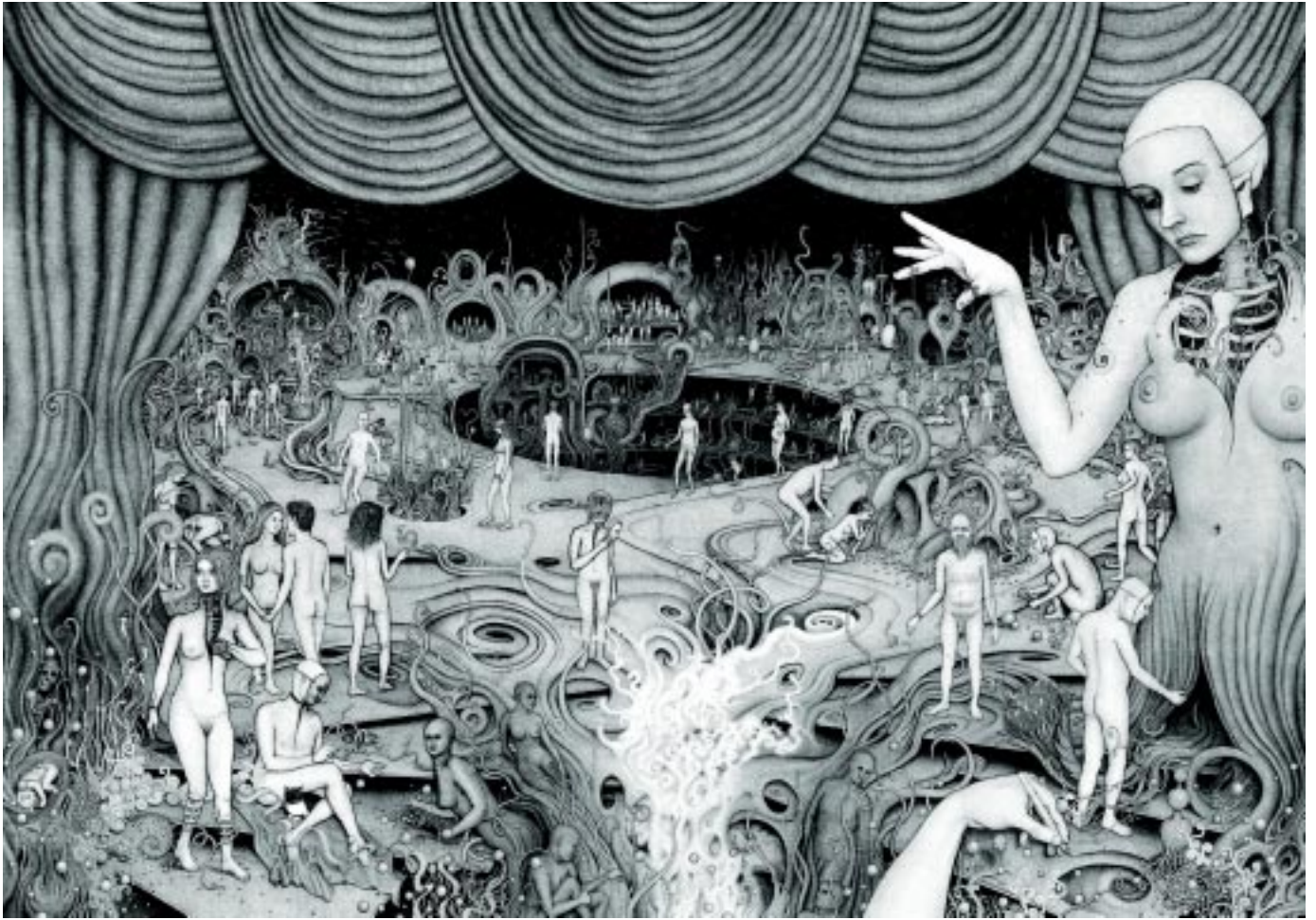
Theatre Ink on board