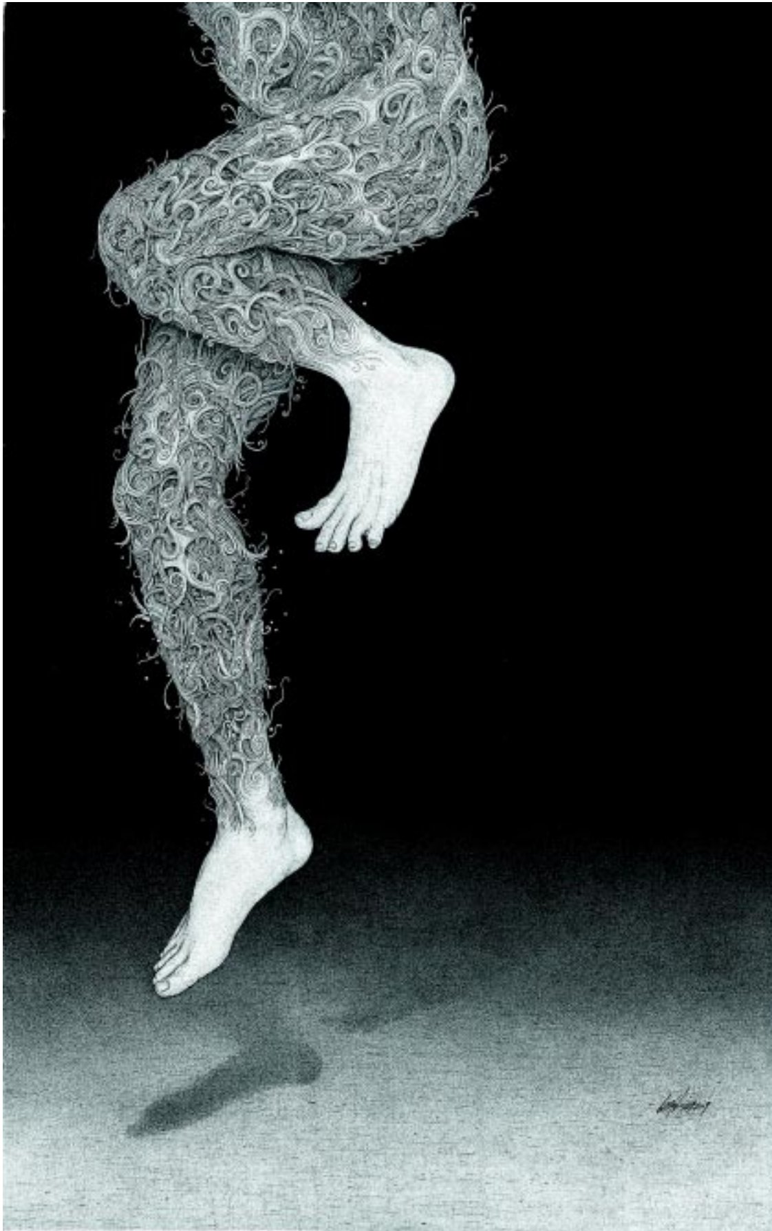
Jump Ink on board