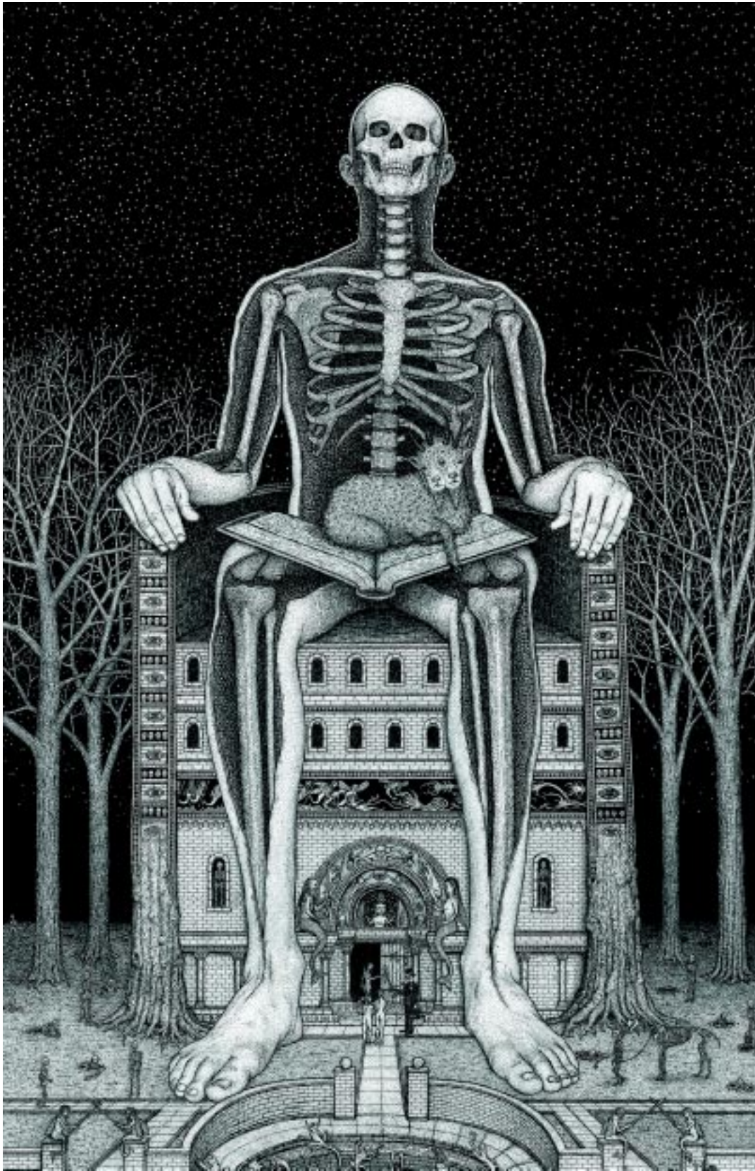
Death Ink on board 32" x 40"

I think about death a lot. I'm very aware of the fact that I only have so much time to get this stuff done before the game is over. In the big picture our lives are so short and our perspective is so narrow. I just want to communicate what my experi-