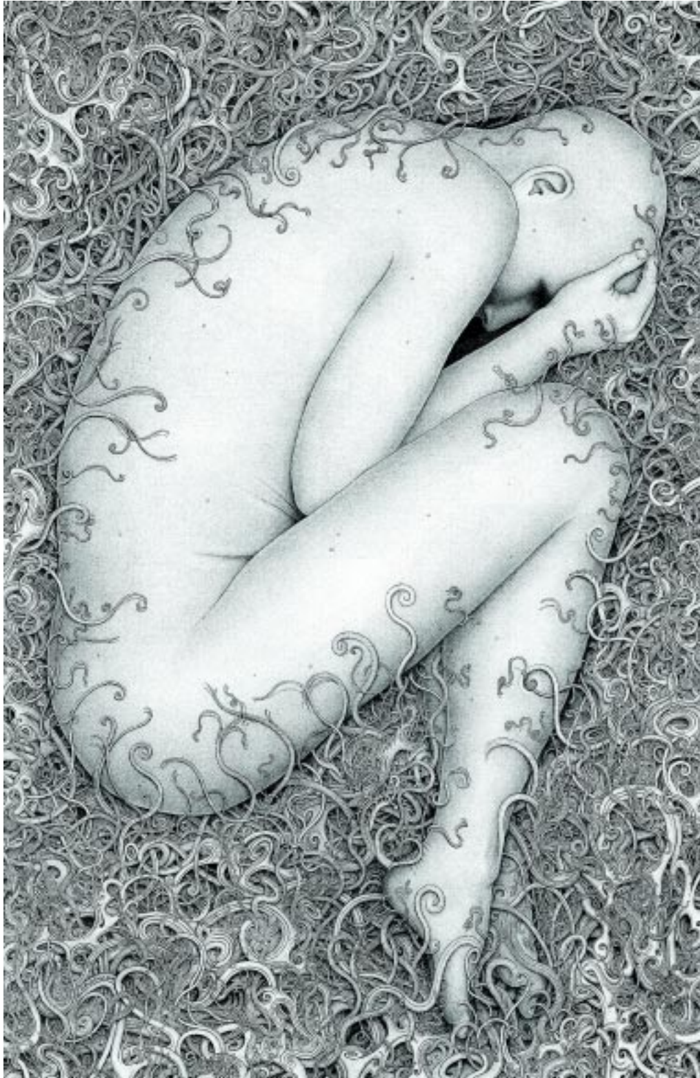
Fetal Position Ink on board 32" x 20"

All of my work takes a long time to complete. Last year I finished my first solid body of work and had my first solo show. I worked on that series for four years. The new series I am working on now has to do with reflecting on my past work and searching for a new direction. I am still interested in many of the same ideas I was working on before, but I am trying to refine