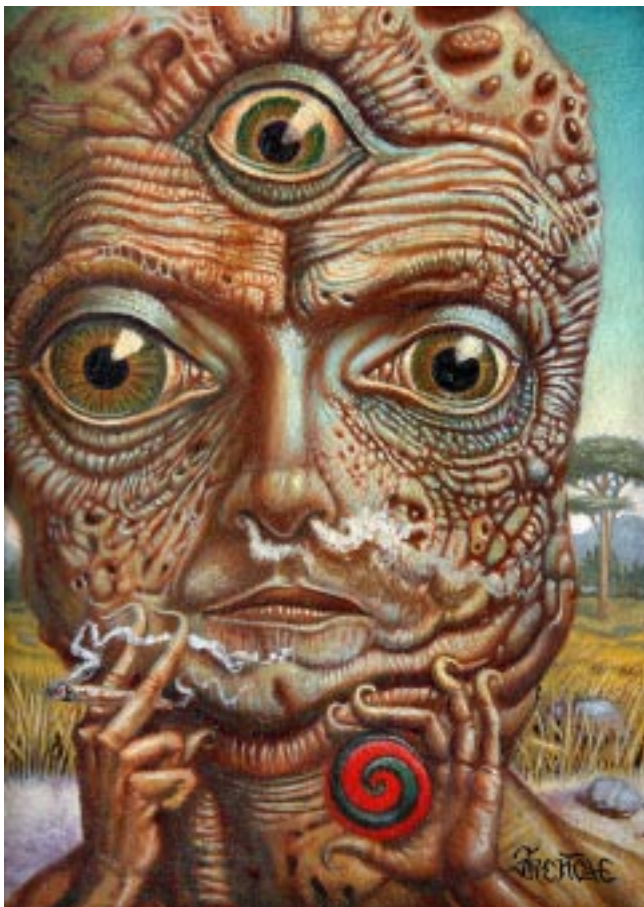
Paradime Shift Oil on panel 5" x 8"