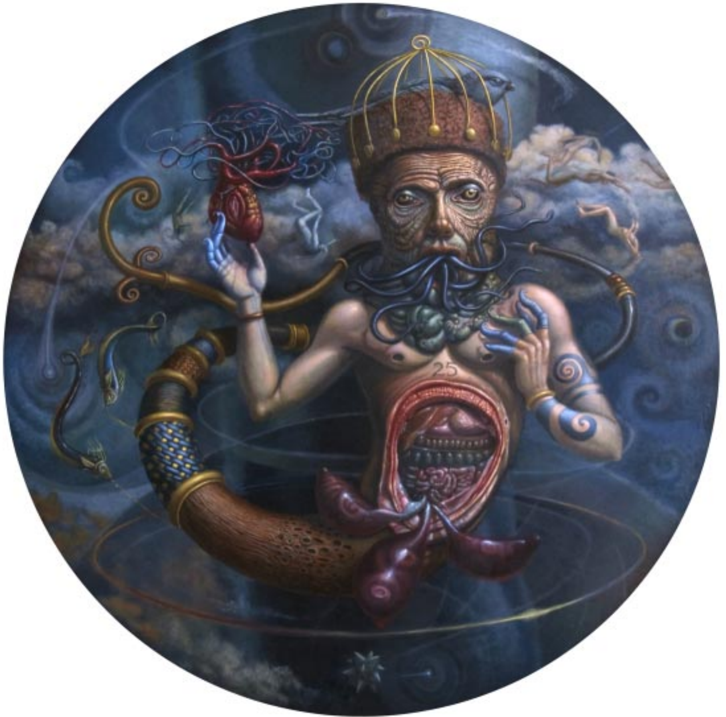
Go Devil Oil on panel 36" round