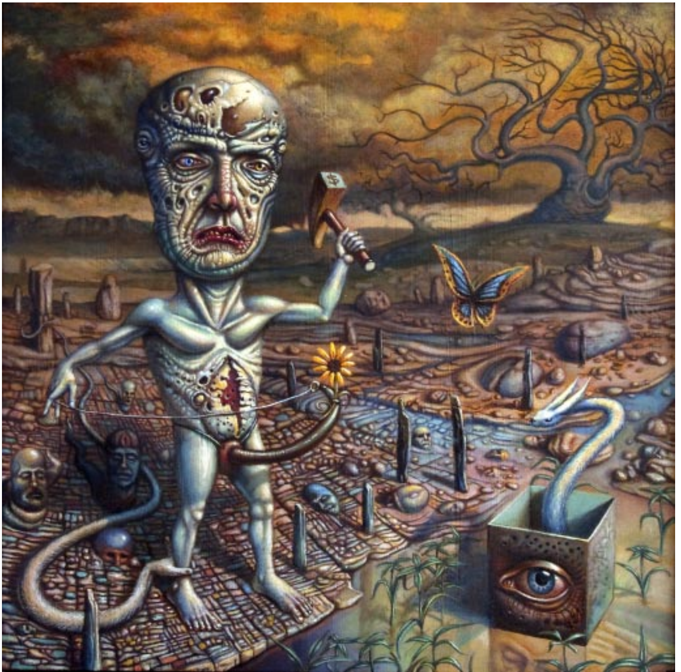
Title etc here.....

is still unfolding and revealing an image of what I was, and what I am becoming. It is my opinion that through self actualization one can easily realize the collective human condition.